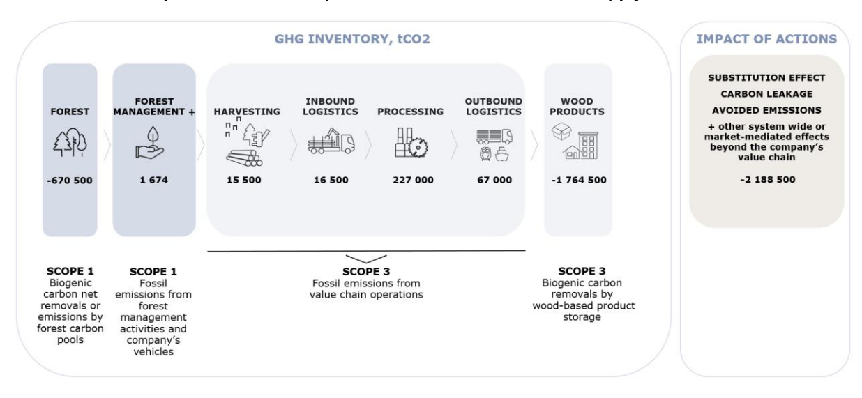
Illustration of the positive climate impact of Tornator and its whole supply chain